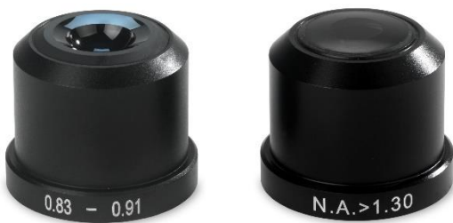
Dry DF Condenser

(4) Dry / Oil Dark Field Condenser (optional).