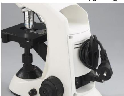
Wire Winding Device