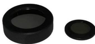
Simple polarizing unit Polarizer & analyzer